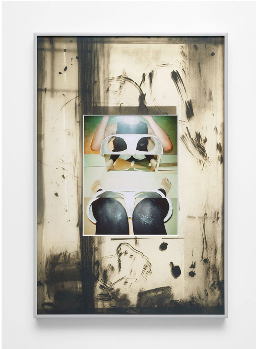
B. Ingrid Olson, Untied knots, strings, she, multiple , 2016–18, inkjet print and UV printed matboard in powder-coated aluminum frame, 25 × 17 × 1.25 inches.